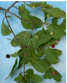
Above & below: Picklewood